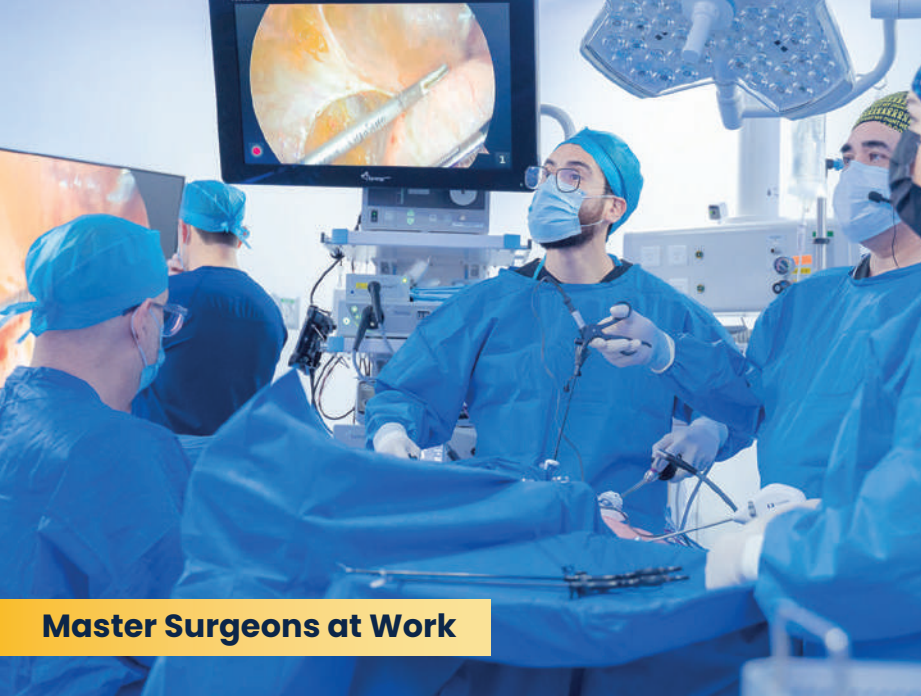
Master Surgeons at Work