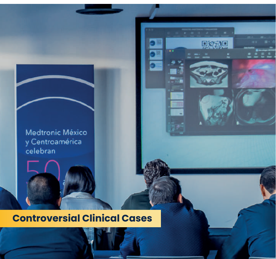
Controversial Clinical Cases